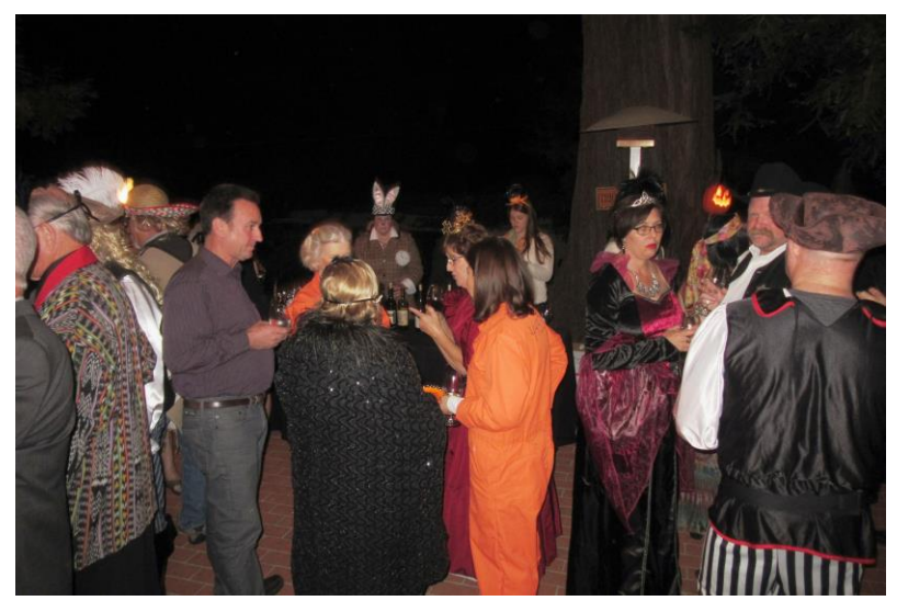
Some of the guests enjoying wine, appetizers and conversation

Spooktacular Halloween Bash, a fun evening enjoyed by many spooks, witches, pirates and other strange characters